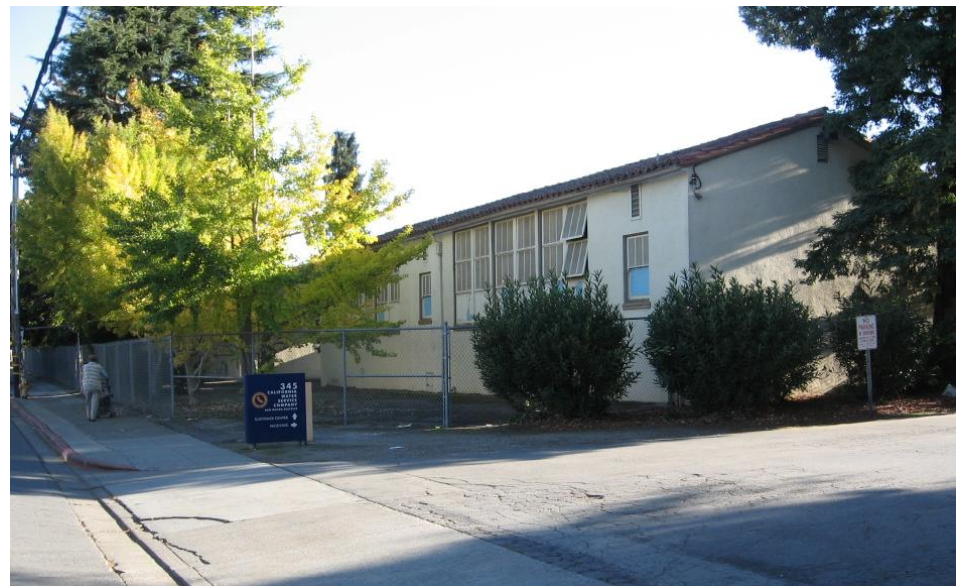
Existing Site Photographs